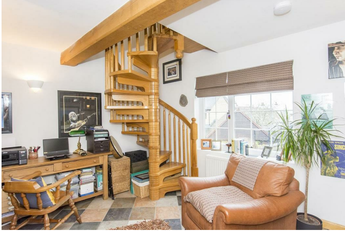
Study 13'9" approx x 10'3" (4.19m approx x 3.12m)

UPVC double-glazed window to front. Built in media unit. Radiator. Tiled flooring. Spiraled bespoke staircase leading up to lounge.