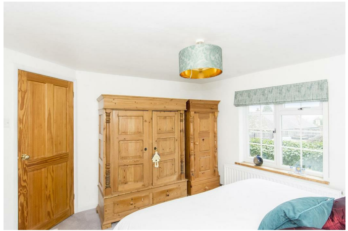
Bedroom Three 11'8" max into recess x 8'5" approx (3.56m max into recess x 2.57m approx )