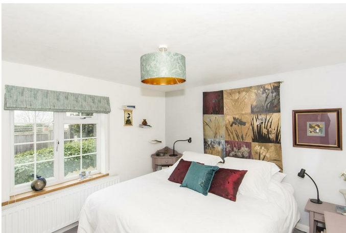
UPVC double-glazed window to front. Radiator.