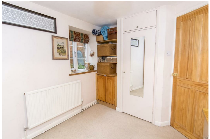
UPVC double-glazed window to rear. Built in cupboard. Radiator.